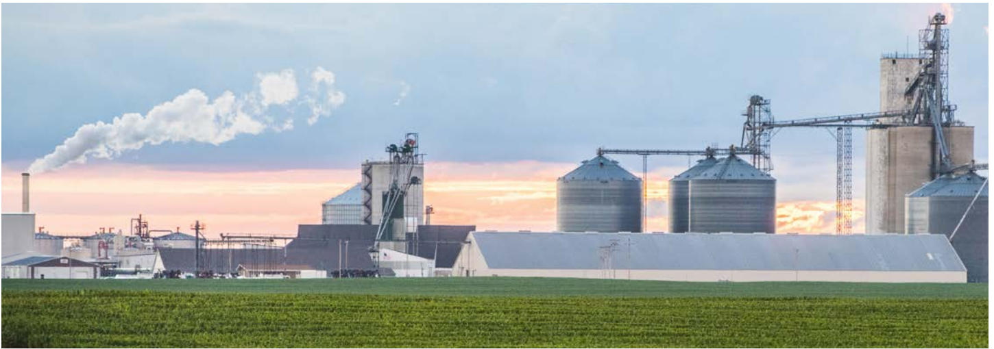
Plants like this one in Nevada, Iowa, commonly use dry mill technology to process corn into fuel-grade ethanol and distiller's grains.

U.S. Department of Energy's (DOE) Co-Optimization of Engines and Fuels initiative conducts coordinated engine and fuels research and analysis, providing the framework for the co-development of fuel and engine technologies that offer the greatest combination of efficiency, performance, and fuel diversification. As part of this initiative, researchers are exploring how blendstocks, including ethanol, can improve performance. Ethanol contains less energy per gallon than gasoline—a gallon of pure ethanol (E100) has 76,330 British thermal units (Btu) of energy while a gallon of gasoline typically contains about 114,000 Btu. The impact on fuel economy (miles per gallon) will depend on the ethanol content of the fuel, up to a maximum