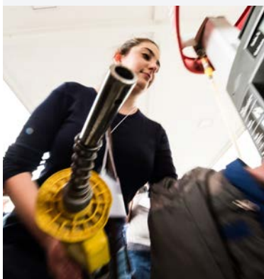
A customer pumps E85 at a public fueling station.

Fleet drivers expressed a genuine interest in E85 after the initial FFV roll-out. But with only six E85 fueling stations available to support more than 1,000 FFVs, the city quickly realized the need for E85 infrastructure expansion. Initially, the city lacked the funds to support such a project, but officials worked with the Chicago Area Clean Cities (CACC) to develop project goals, cost estimates, and timelines. Being prepared with these plans allowed the city to take advantage of a funding opportunity when it arose.