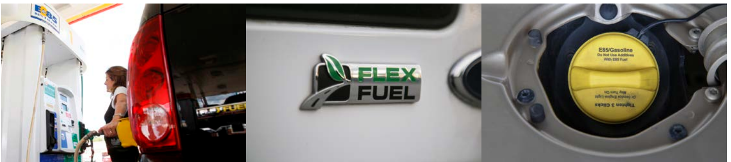
FFVs are available in a wide range of models, such as sedans, pickup trucks, and minivans.

the life cycle includes growing the feedstock and delivering it to the ethanol plant, and then producing, distributing, and using the fuel in vehicles. The life cycle steps for gasoline include crude oil extraction, transportation to a refinery, the oil's conversion into gasoline, then distributing and using the fuel in vehicles. An analysis conducted by Argonne National Laboratory found that, when entire life cycles are considered, corn ethanol reduced greenhouse gas emissions by an average of 34% over traditional fuels. Depending on the feedstock, emissions reductions of cellulosic ethanol compared to conventional gasoline range from 51% to 88% when land-use change emissions are considered. ■