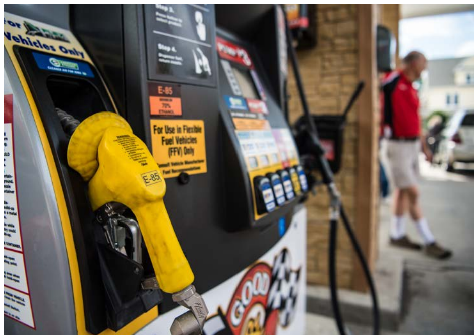
Ethanol may be labeled in a variety of ways at the pump.

Nearly all fuel-grade ethanol is sold as E10, a low-level blend of 10% ethanol, which is approved for use in all conventional light-duty vehicles. E15 (10.5%–15% ethanol) is approved for use in model year (MY) 2001 and newer light-duty conventional vehicles. To use E85, a high-level blend containing 51%–83% ethanol (depending on geography and season), a vehicle must be a flexible fuel vehicle (FFV). Intermediate blends between E15 and E85 are also approved for FFVs. These blends are typically available through blender pumps, which draw fuel from two storage tanks—one containing regular gasoline, and another containing E85. The most common blends are E20 and E30.