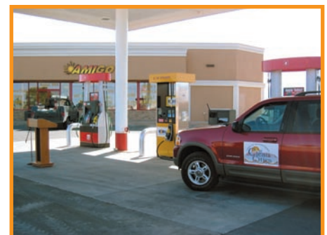
Alternative Fuels Vehicle Network

The Land of Enchantment's first fill-up of E85 happened in July 2003, at the opening of a newly remodeled Phillips 66 station in Santa Fe. Standing proudly beside the gasoline pumps was a single E85 dispenser, as banners billed E85 as the "Clean Air Fuel Choice." That site will be part of network of at least four stations that serve New Mexico. By mid-2004, a second E85 site will be installed in Santa Fe. Both are owned and operated by Albuquerque-based Amigo Petroleum. Also expected this year is public E85 fueling at an Albuquerque site that previously sold gasoline and diesel to private commercial customers. A fourth E85 location is anticipated at the Los Alamos National Laboratory (security concerns may prevent it from being publicly accessible).