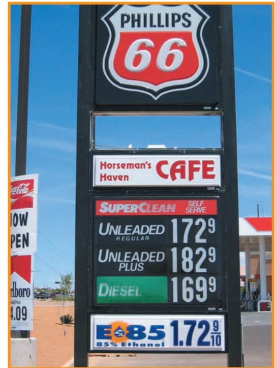
E85 is billed prominently on the price sign with other mainstream motor fuels.

In the first few weeks of selling E85 in Santa Fe, however, station operators experienced an unexpected problem. The snazzy signage drew attention even from people without E85-capable vehicles. "One guy with a vintage Mustang insisted on buying it. He wanted the higher octane," says Mason. The station is devising new ways to discourage people from buying E85 if their cars are not equipped to handle it. Mason's organization is also working with car dealers in Santa Fe to expand sales of used flexible-fuel vehicles, with an online marketplace.