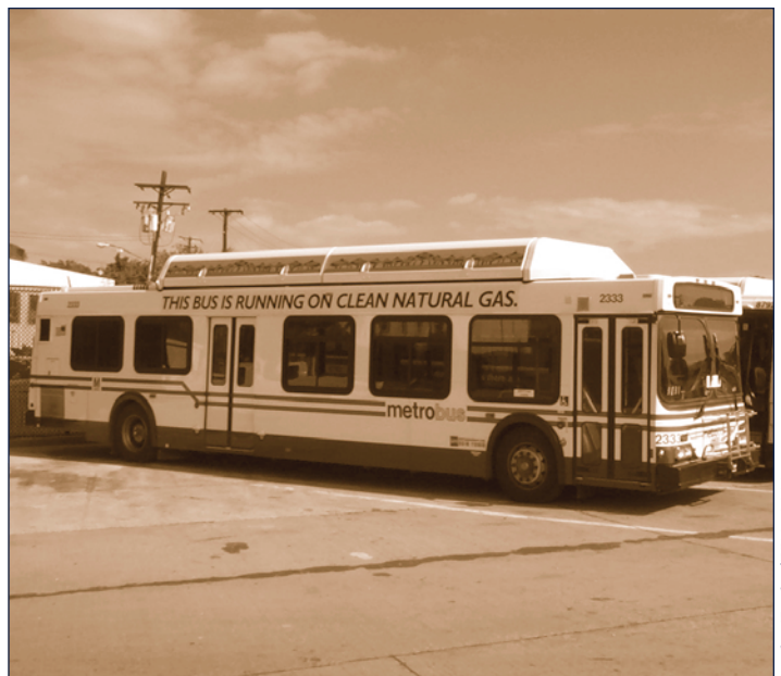
A Tiger Team worked with the Washington (DC) Metropolitan Area Transit Authority to define requirements and specifications to upgrade its CNG bus maintenance and fueling facilities.

The Long Beach, New York, School District wants to make a positive contribution to the local air quality. With that in mind, it is working with a Tiger Team to develop a preliminary CNG school bus fueling and maintenance facility plan.