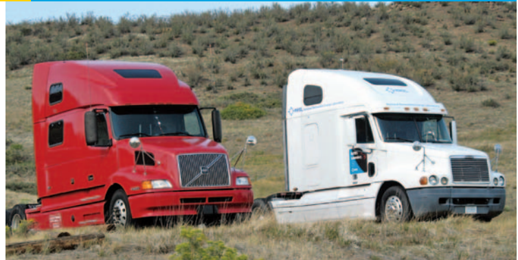
Ken Proctor/PIX 15738

Testing was performed to determine the heat-transfer coefficient of the test trucks using the different thermal-load reduction configurations. The heat-transfer coefficient represents the amount of power required to change the temperature of the truck cab by 1°C. For example, the heat-transfer coefficient for the first test truck in the base configuration was 65 W/°C. Therefore,