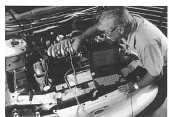
helping them achieve their ambitious goals NGV Southeast Technical Center technicians will help maintain alternative fuel vehicles during the 1996 Summer Olympics.

In addition to this national scholarship effort, some Clean Cities are working with training and conversion centers in their areas to attract new students and give them the special training they need for the expanding automobile field. These cooperative efforts are seen by many Clean Cities participants as increasingly important in of increasing AFV numbers and building infrastructure.