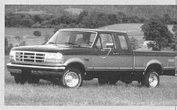
Ford's light-duty propane vehicle.

For a list, call the Ford alternative fuel hotline at 1-800-ALT-FUEL.