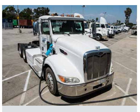
More heavy-duty vehicle manufacturers are now offering plug-in models for fleets.

Getting started with an EV is easy thanks to the charging "cordset" that comes with most vehicles. Photo by Erik Nelsen, NREL 64277.