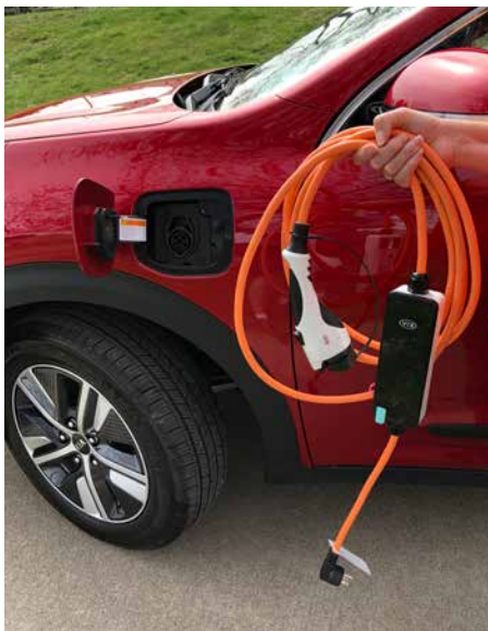
Getting started with an EV is easy thanks to the charging “cordset” that comes with most vehicles.

For up-to-date information on available models, use the Alternative Fuels Data Center (AFDC) Vehicle Search tool ( afdc.energy.gov/tools ) or the Find a Car tool on FuelEconomy.gov ( fuelconomy.gov/feg/findacar.shtml ).