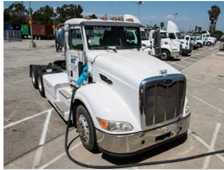
More heavy-duty vehicle manufacturers are now offering plug-in models for fleets.