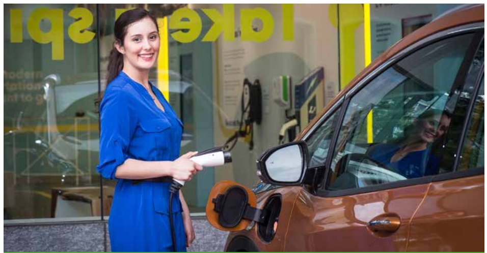
Electric vehicles are charged by plugging the vehicle into an electric power source.

All-electric vehicles do not have conventional engines but are driven solely by one or more electric motors powered by energy stored in batteries. The batteries are charged by plugging the vehicle into