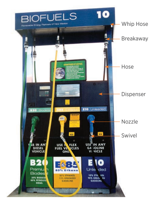
Figure 1. Dispenser and Hanging Hardware. Photo by Charles Bensinger, NREL 13531