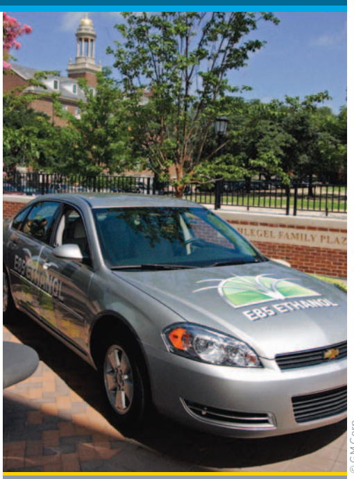
Flexible fuel vehicles can be fueled with unleaded gasoline, E85, or any combination of the two.